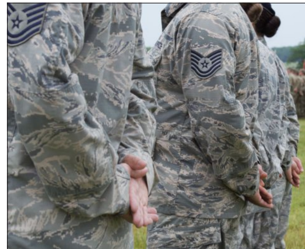
Airmen from the 127th Wing, Selfridge Air National Guard Base, and the 110th Wing, Battle Creek Air National Guard Base, participate in the 2019 Michigan National Guard Memorial and Pass in Review, Camp Grayling Maneuver Training Center in Grayling, June 28, 2019